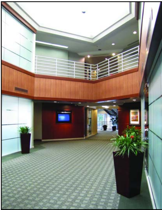
Two-story atrium lobby