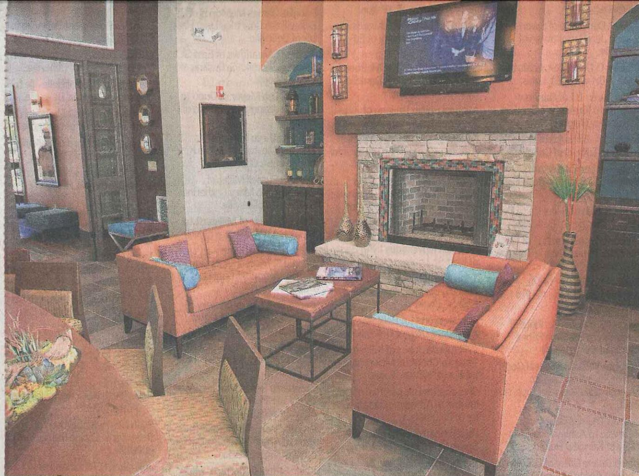
Inside the clubhouse, you'll find a conversation area in front of a fireplace.